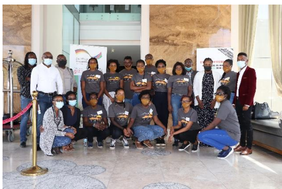
RMI participants at public presentation in Windhoek

As an integral component of the research process, training remains a core function. Unfortunately, our training activities were also severely curtailed during the period under review. No school groups visited the institute, and three planned university excursions were cancelled. Our annual Youth Environmental Summit (YES), scheduled for May 2020 and focusing on Grade 11 learners from the Hardap Region, was cancelled. Our partners in this particular intervention, MEFT/giz- BMCC II project agreed to a modification in the approach – and RMI (Research Methodology Internship) was born. Modelled on the very successful SDP, RMI recruited 13 Namibian university graduates to conduct a countrywide survey on perception and attitudes of the Namibian public regarding the plastic bag levy, introduced in 2019. The research was designed in collaboration with the University of Plymouth in the UK (page 13).