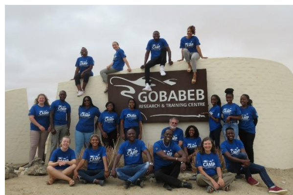
CAMP participants at Gobabeb

By design, the specific focus of each training iteration will change so that after the full implementation period a suite of different topics that comprehensively cover climate change issues will have been addressed. The first CAMP was conducted in January 2021 with the theme ‘Science of climate change and local resilience’. Emphasis was placed on the fundamental value of robust scientific data to underpin climate change projections and coping strategies at the local level. Eleven recent graduates from across the country received two weeks of intensive, science-based training on current climate change matters at Gobabeb. Training modules were delivered by Gobabeb staff, as well as invited local and international experts, via face-to-face and Zoom lectures. Long-term weather data sets provided by the Namibia Meteorological Service were processed and interpreted as a practical exercise. Using all the information gathered over the intense two-week programme, the participants developed their own outreach products (a set of four posters – page 18) and the teaching skills to transfer knowledge gained to an estimated 1 650 senior secondary school learners from 44 schools across Namibia.