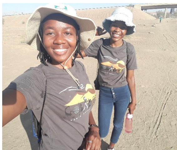
RMI participants assessing plastic waste in //Kharas

The training programme further delivered on building capacity in 13 graduates, who are now better equipped and confident in survey and observational techniques, and have enhanced skills in research design, execution, analysis and presentation. These well-rounded young professionals will be able to leverage this training opportunity to boost their credentials as they enter a very competitive job market.