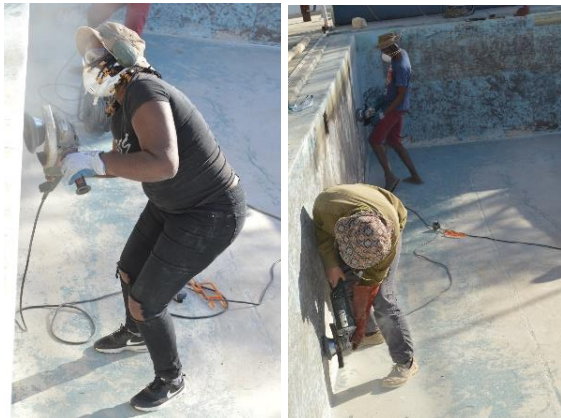
Interns at work, prepping the pool for repairs

underscored the importance of offering options that contribute to well-being and good health. The swimming pool, out of commission for several years due to cracks, was refurbished with support from MEFT – much to the delight of our staff. They had spent many a weekend scraping down and grinding away surfaces, preparing the pool for its makeover!