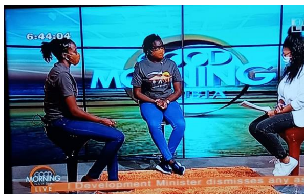
Talking about plastics on NBC's Good Morning, Namibia : 02 October 2021

Key findings from the consumer survey conducted in Katima Mulilo, Ondangwa, Windhoek, Keetmanshoop and Walvis Bay were that although most respondents were aware of the levy, there was limited understanding as to the reasons for its implementation. It also appears to be having negligible effect as the demand for single-use plastic bags by shoppers remains high. Plastics are the largest component of waste generated in households across Namibia, irrespective of region or economic status; and other sources of single-use plastics should be addressed in the same way as shopping bags. Most respondents are aware of plastic pollution in their respective areas, but in general were reluctant to assume personal responsibility to effect change.