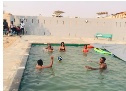
Interns at play, enjoying the pool

As we embark on the future, the sustainability of Gobabeb remains a top priority. With our sights on celebrating 60 years of existence and research excellence in 2022, the challenge will be on all those touched by Gobabeb over six decades to rally to its call for support, ensuring that the Gobabeb legacy will live on.