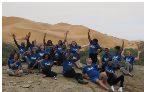
CAMP participants at Gobabeb

to be hugely successful in developing and sharing evidence-based information on climate change in Namibia.